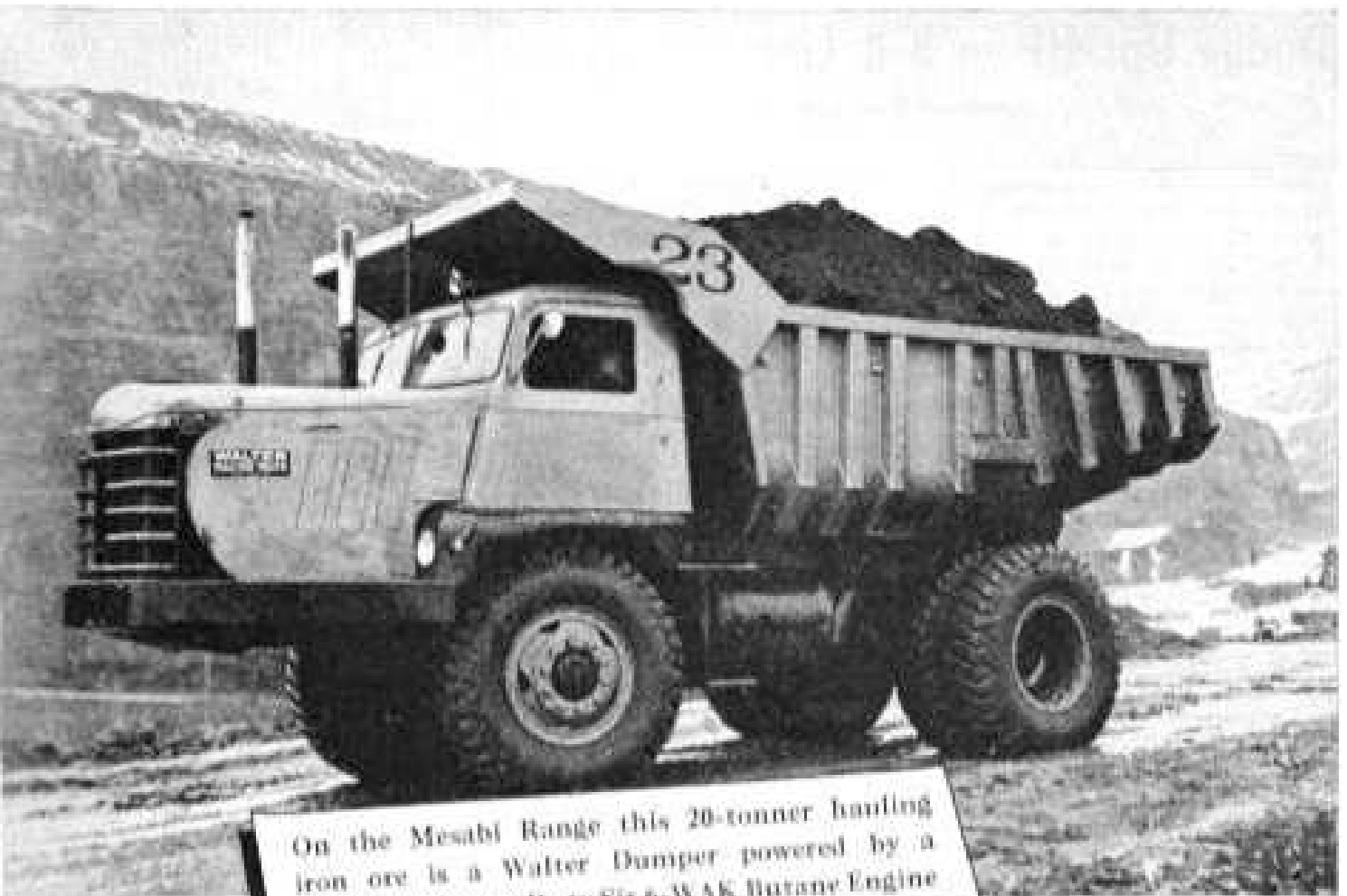
On the Mesabi Range this 20-tonner hauling iron ore is a Walter Dumper powered by a Waukesha Super-Duty Six 6-WAK Butane Engine